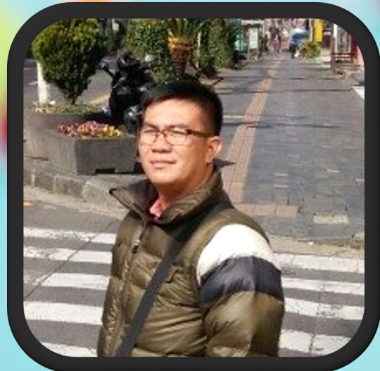
RTN ERWIN CURVA OCTOBER 7