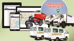
GPS VEHICLE TRACKING & FLEET MANAGEMENT SYSTEM